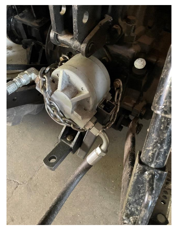
Ensure the support brace is orientated correctly to prevent PTO pump from spinning.